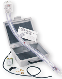
1212 gas pressure kit